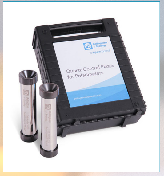
Fig 2. Quartz Plates, available in single or multiple box sets

In order to better suit customer needs, ADP600 Series polarimeters are now designed around a modular selection guide. This approach means customers will have everything they need for their application without spending excess money on things that they don't.